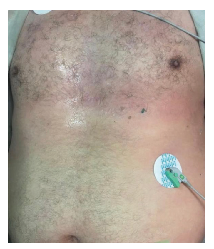
Figure 1. Patient's rush on anterior thorax and abdomen